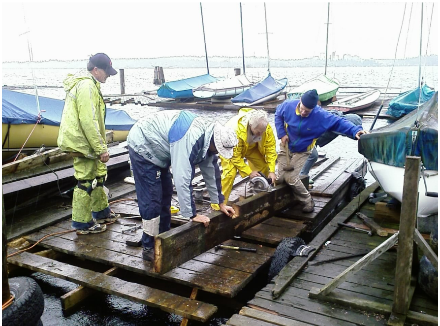
Thistle members replacing structural beam at the north end of marina.

CYC volunteers from the Thistle and Snipe fleets recently organized two work parties to repair the floats that they rent out from the Leschi Concessionaire. The Thistle and Snipe fleets were out in force with many family members represented. The first work party was on September 29 th that started at 8:00AM moving boats out of the way and then tackled the most vulnerable “sinking” float in the north side of the marina where the Thistles reside. Several critical structural beams were relocated and secured with new floatation and the fleet replaced a substantial number of planks. At the south marina, where the Snipes reside, the submerged float structures were found to be in much better shape but many planks needed to be replaced, and the work ended when the wood ran out. Although a lot of work was done that day at it was obvious that more needed to be done so a second party was duly organized. During the second work party on Oct 20 th , many additional repairs were made including completely replanking one of the Snipe fleet floats. Extra wood was stockpiled for future repairs as well. The focus on the north end was to replace and fix areas where the docks rub on the pilings. At least three key piling to dock interface points were fixed. Although there is still quite a bit more left, CYC proved wholeheartedly to the city and concessionaire that we can make valuable contributions to the survival of the marina and we need to thank all who volunteered their time.