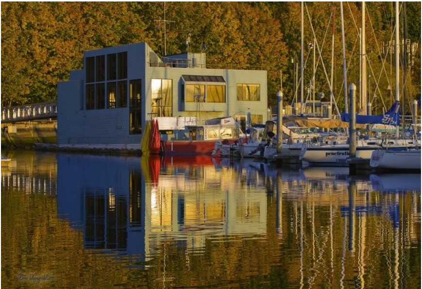
Clubhouse at Shilshole Bay Marina, Ballard