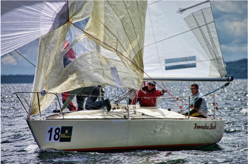
Tremendous Slouch – 2015 Boat of the Year