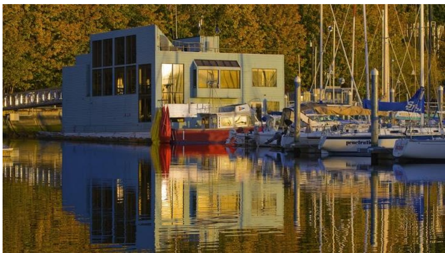
Clubhouse at Shilshole Bay Marina, Ballard

We have the club to do more of what we, as sailors, want to do together than we could on our own. The club is our platform to help us share our excellent sailing lifestyle with more people and do more with each other and for each other.