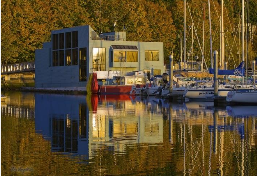
Clubhouse at Shilshole Bay Marina, Ballard

If you love sailing, please consider joining the Corinthian Yacht Club of Seattle. We need all the people who enjoy the club to sign up and be a part of supporting our community through our organization. Many of our members continue to be members of other clubs, each supporting our sport in their own way. Even if you don't happen to own a boat, you can own our yacht club and claim your equal stake and influence in supporting our sailing way of life through our club. The Adult/Family membership is just $35 a month. Please talk with your friends who are members about joining.