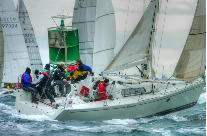
Terremoto – CYC Boat of the Year