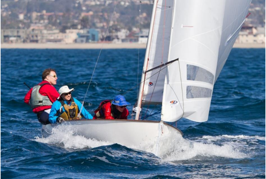
Ranger – 2014 Boat of the Year